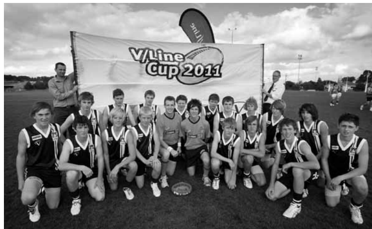
V/Line Under 15 Team

The next WorkSafe VCFL representative feature will be the WorkSafe Country Championships which will be played across the VCFL on Saturday May 28th. Go to www.vcfl.com.au to see the fixtures.