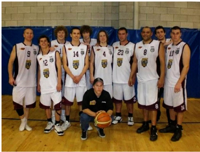
Harbour Heat Reserves 2009 Champions