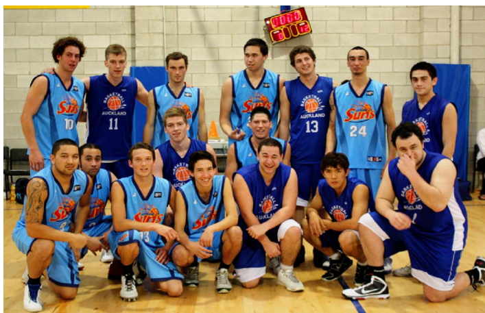
Northland Suns (Light Blue) verses Basketball Auckland (Dark Blue)