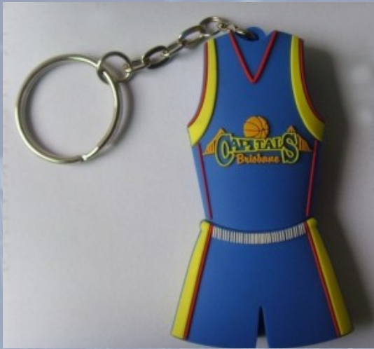
USB STICK $15.00