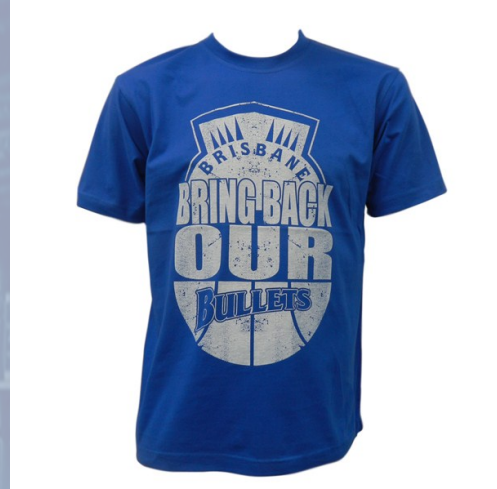
BULLETS T $15.00