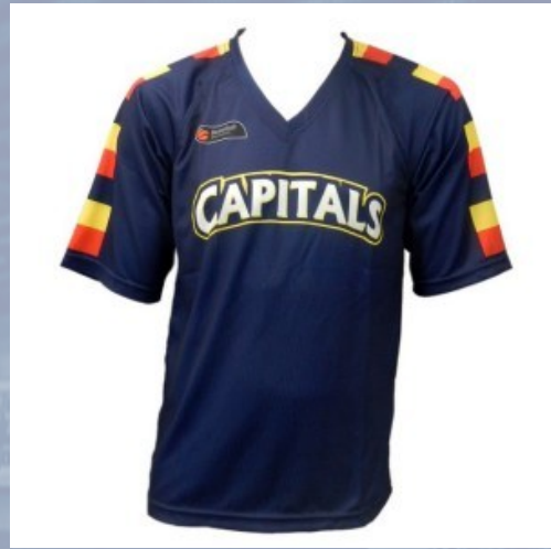
WARM UP SHIRT $45.00