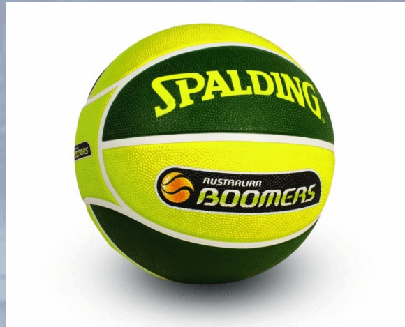
BOOMERS BALL $15.00