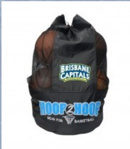
BALL BAG $19.80