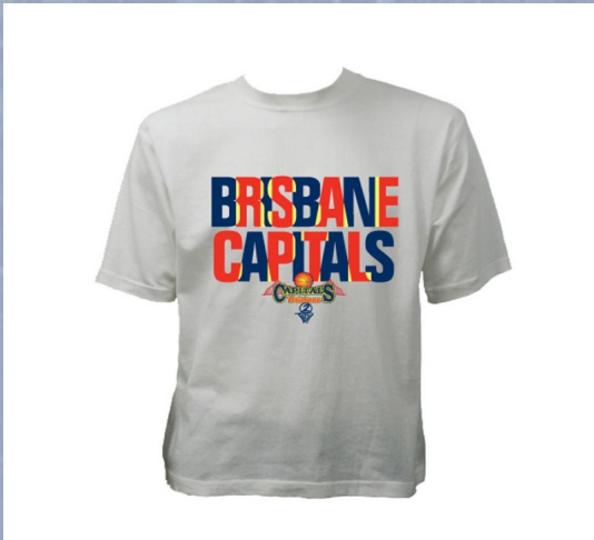
WHITE T $20.00