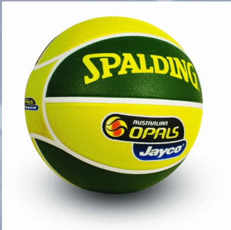
OPALS BALL $15.00