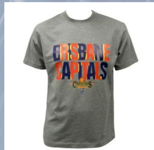
GREY T $20.00