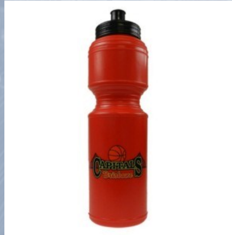
WATER BOTTLE $8.80