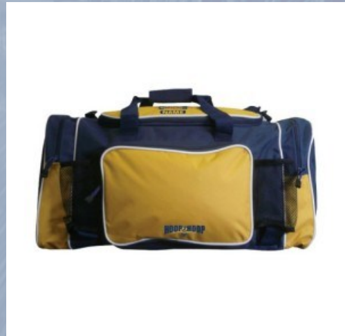
SPORTS BAG $45.00