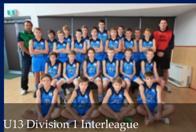
U13 Division 1 Interleague