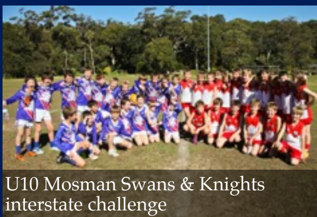
U10 Mosman Swans & Knights interstate challenge

It's fantastic to see how all the kids have embraced their new hoodie as you can't go