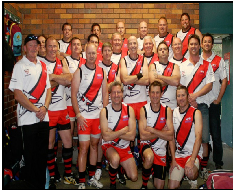
Some of the Bayside Bombers 2012 Squad

2012 saw us win 8 out of 12 games in a fairly competitive season, but at the end of the day we still play with the AFL Masters motto of "Footy for Fun". Another notable accomplishment for the Bombers was the AFL Masters