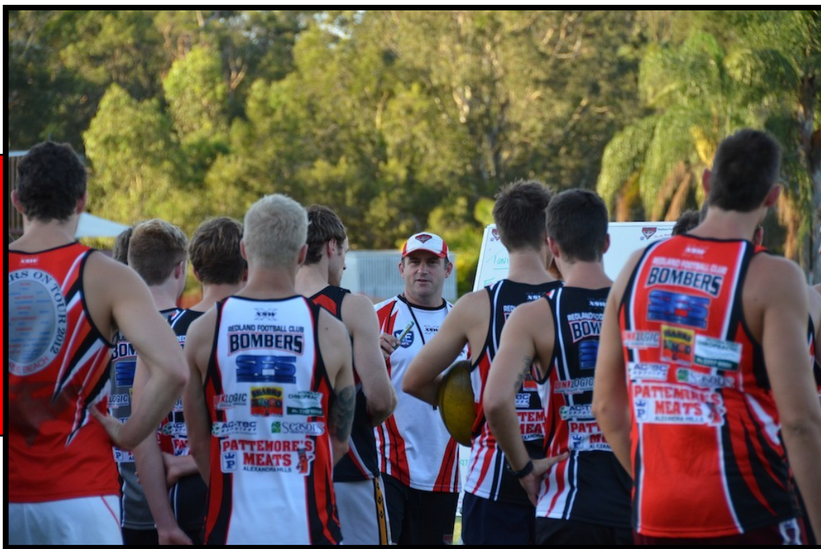
Redland Seniors get back into pre-season