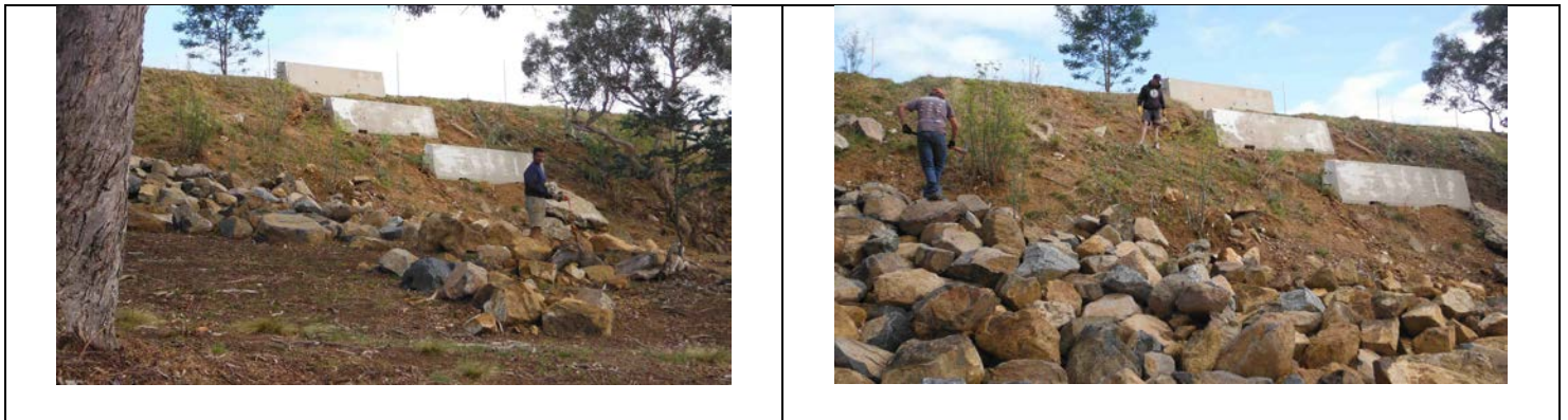
Some Photos of the new 'Fairbairn Park Trials Centre' Our first Club Trial is there on 17 February

2013 TCC Calendar First Club Trial at Trials Club of Canberra Club Grounds Help Needed Memberships Where are the bikes? President's Report Classifieds