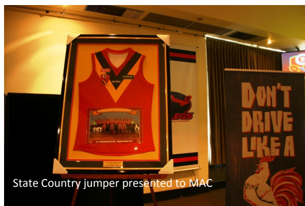
State Country jumper presented to MAC