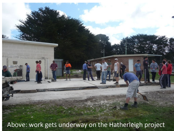
Above: work gets underway on the Hatherleigh project