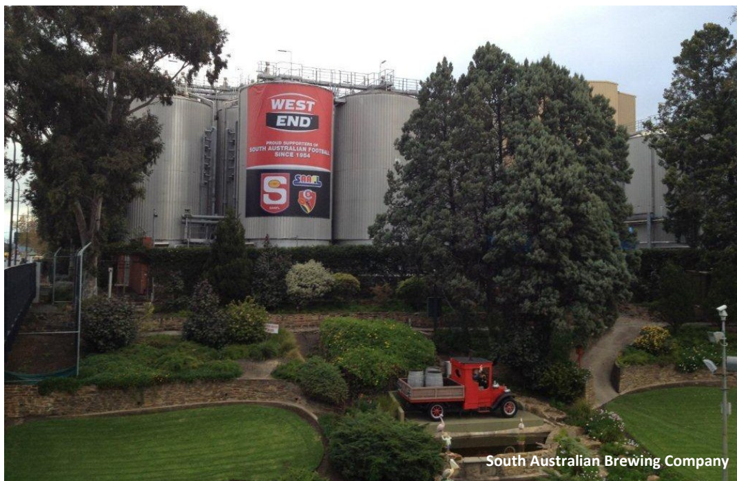
South Australian Brewing Company