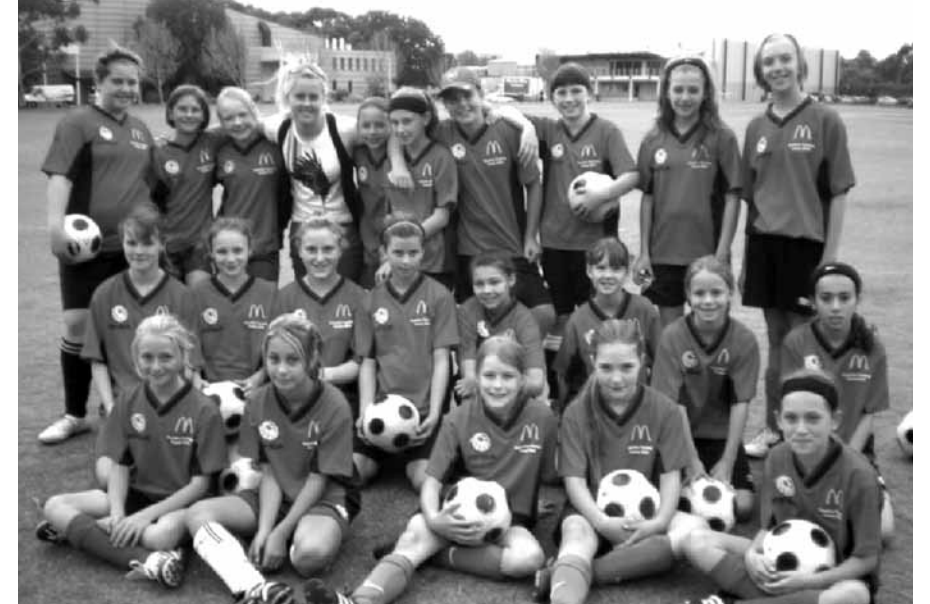
A group of our Country girls from the Regional Centres of Excellence

standardised approach to the development of these young players through adherence to the National Curriculum and following the criteria developed under the accreditation & rating scheme.