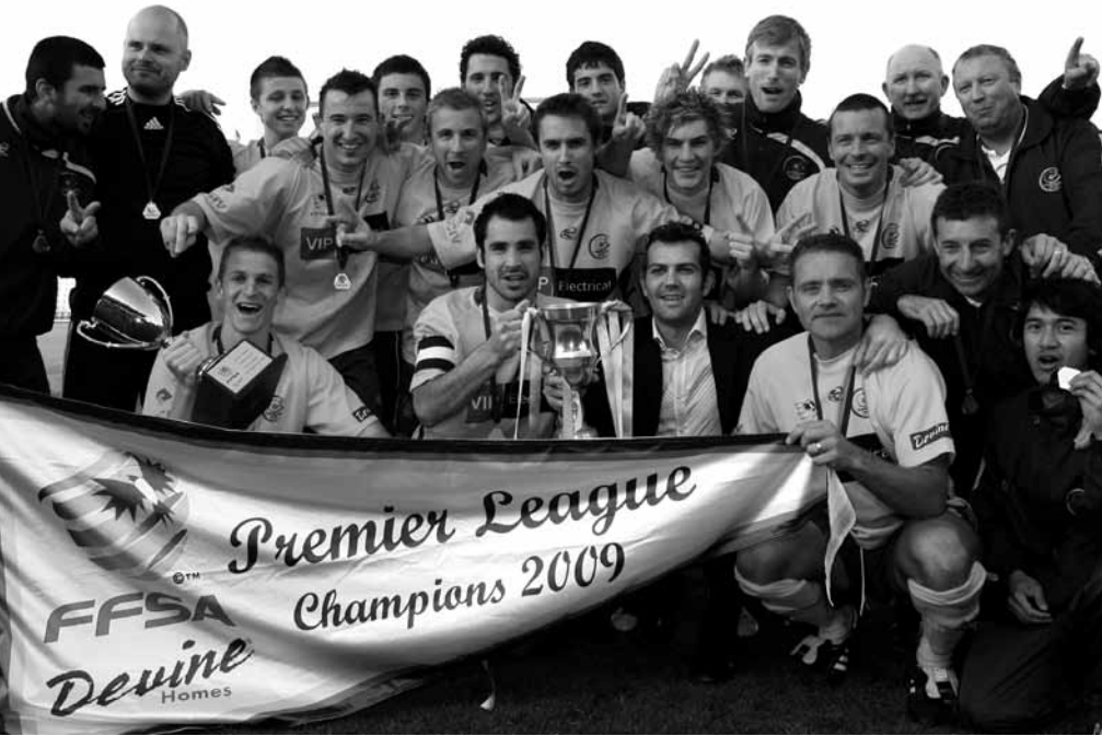
Cup Winners Cumberland