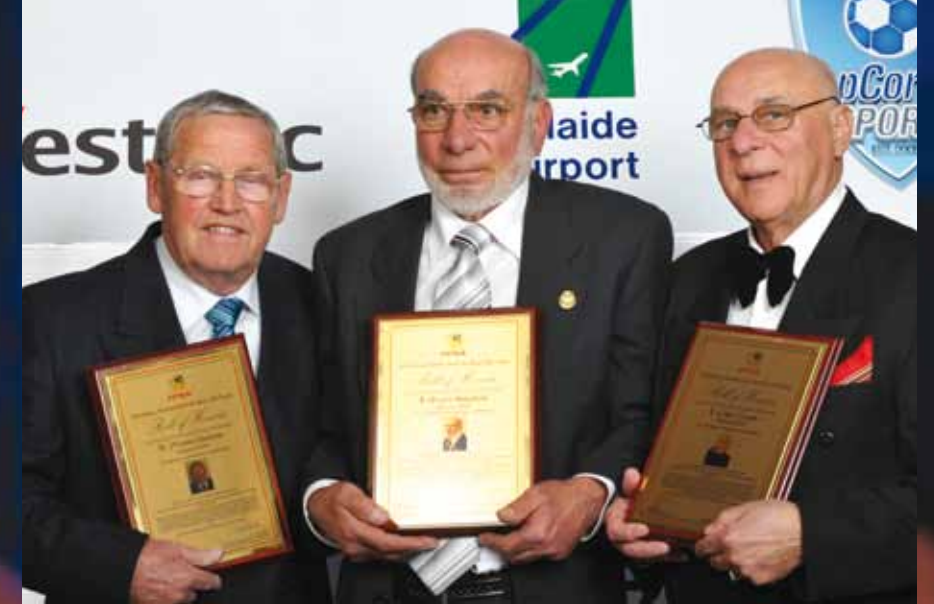
2009 Hall of Fame Inductees

The Football Federation South Australia Awards Night continues to provide an opportunity for the football community to acknowledge the achievements of the sport and to celebrate the season that has been.