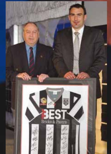
Minister for Recreation, Sport and Racing, the Hon. Michael Wright MP