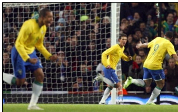
Brazil's midfielder Elano (C) celebrates scoring a goal during their International friendly match against Italy at the Emirates Stadium, London, on February 10, 2009. Others are unidentified.

The capacity crowd of 60,077 were lapping up every feint and flick from Brazil's showmen, but Italy emerged after half-time determined to salvage some pride. Luca Toni beat Cesar with a bundled effort midway through the second half, only to see his strike disallowed because he had handled while trying to control Pirlo's pass. Both teams were fiercely competitive until the end. It was Italy though who finished on top and it took a brilliant reflex stop from Cesar to deny Toni a late consolation goal.