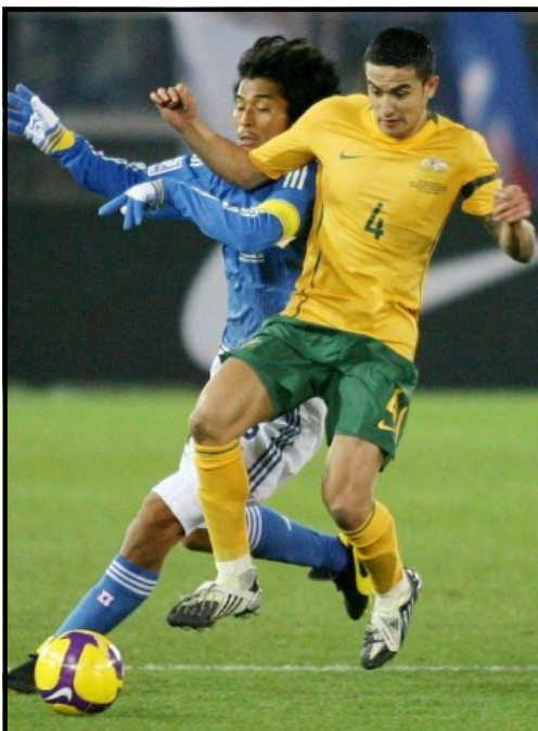
Australia's Tim Cahill (R) fights the ball with Japan's Yuji Nakagawa during the 2010 FIFA World Cup Asia final qualifiers Group A match in Yokohama on February 11, 2009.

Tamada headed over from close range soon after before Japan came agonisingly close to a winner four minutes before full-time when Hasebe's shot deflected off Tamada but rolled inches wide of the post.