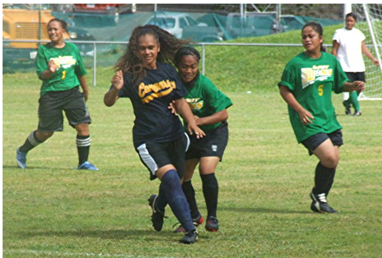
Leone Lions' varsity team in action during their 2nd game of the season against Fa'asao Marist Cougars on Saturday, Jan. 24, 2009 at Pago Park Soccer Stadium. The Lions won 4-2.

In this issue, read the rundowns of the first three rounds played on Jan. 17, 24 and the 31 st as well as photos galore of these