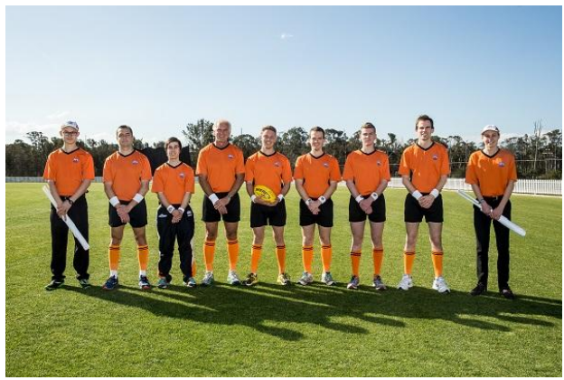
Above: Premier Division Grand Final umpire panel

Above: Women's Division One Grand Final umpire panel