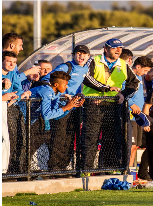
Location of Ground Stewards and Role Modelling