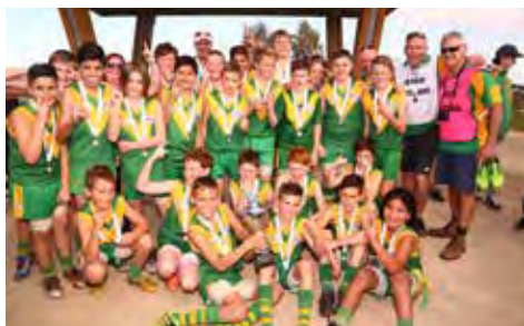
Spotswood's Under-12B team celebrated their win in style after their match on Sunday.