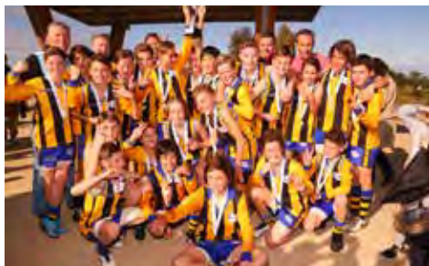
St Bernard's won the Under-12A flag after defeating Williamstown Juniors at Wootten Road Reserve.