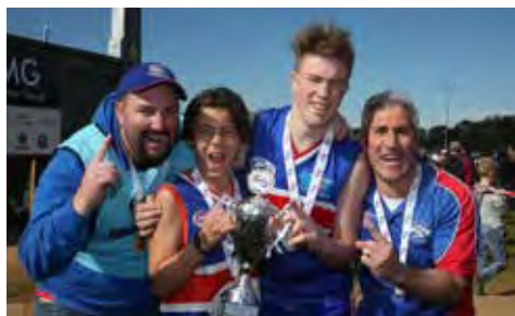
Point Cook celebrated its premiership victory against Williamstown Juniors on Sunday.