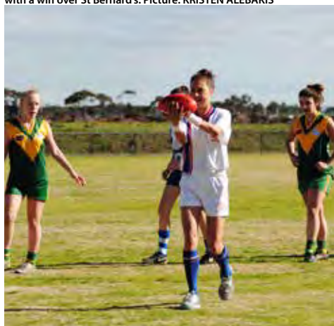
An umpire throws up the ball in the Under-15 girls match at Wootton Road Reserve.