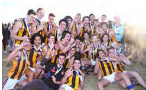
St Bernard's Under-17A team made it two premierships in a row after defeating Werribee Districts.