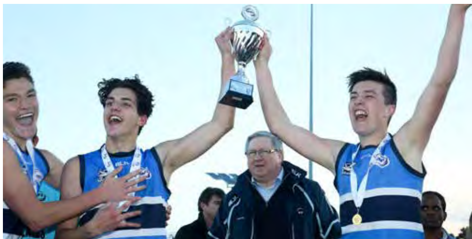
Sanctuary Lakes secured its third straight premiership in the Under-15A competition.