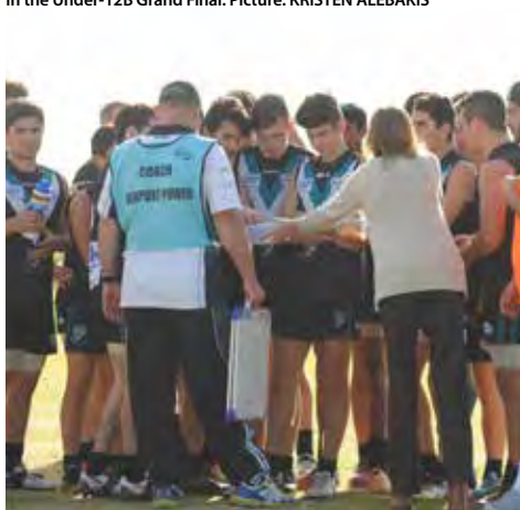
Newport Power overcame Albanvale in the Under-17B Preliminary Final.