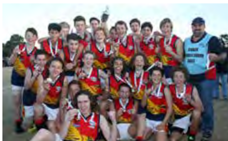
The Yarraville Seddon Eagles defeated Caroline Springs in the Under-14A Grand Final.