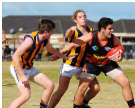
The Wyndham Suns booked its spot in the Under-17B Grand Final with a win over St Bernard's.