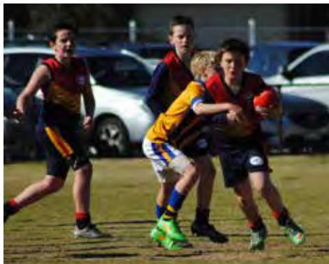
Spotswood's Under-15 Girls won a spot in the Grand Final after defeating the Sunbury Lions. Picture: KRISTEN ALEBAKIS