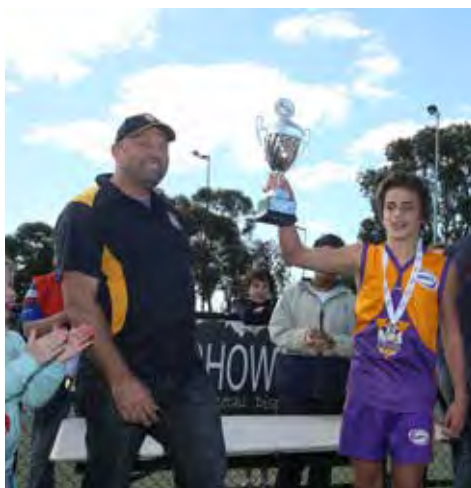
Altona Junior coach and captain hold the premiership cup aloft after winning the Under-14B premiership.