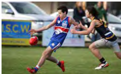
Point Cook went head-to-head in the Under-13C Grand Final at Galvin Park.