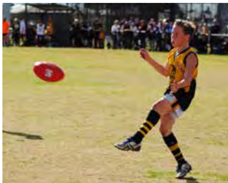
A Werribee Districts youngster gets the kick away against Spotswood in the Under-12B Grand Final.