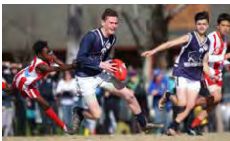
Hoppers Crossing proved too strong for North Footscray in the Under-13B Grand Final.