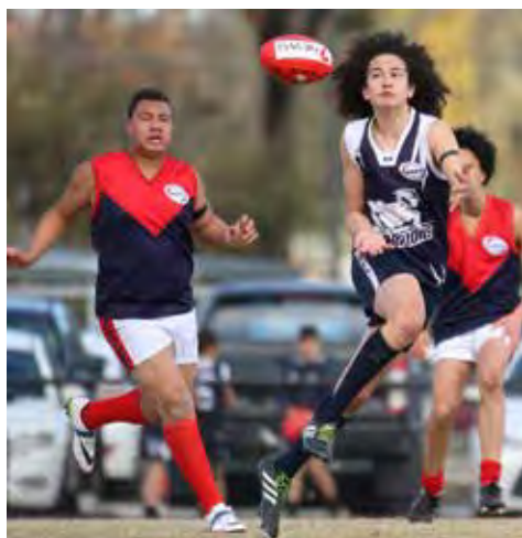
A Hoppers Crossing youngster attempts to take a mark against St Albans in the Under-14C Grand Final.