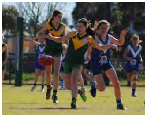
Spotswood's Under-15 Girls won a spot in the Grand Final after defeating the Sunbury Lions. Picture: KRISTEN ALEBAKIS