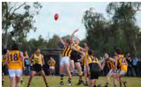
A big crowd gathered at Wootten Road Reserve for the Under-17A match between St Bernard's and Werribee Districts.