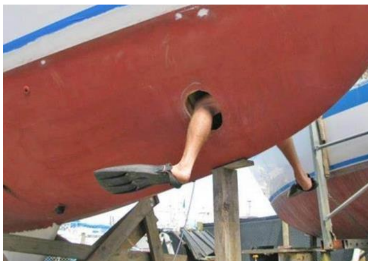
New Bow Thrusters!!!