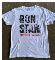
Ronstan White T'Shirt SIZE - S