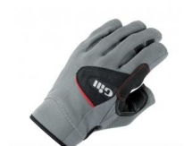
Gill Deckhand Gloves Short Finger SIZE - Jnr RRP $33