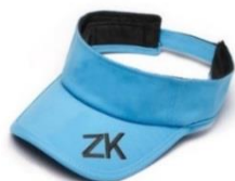
Zhik Visor – Blue RRP $20