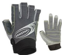
Ronstan Race Gloves SIZE – M RRP $31.50