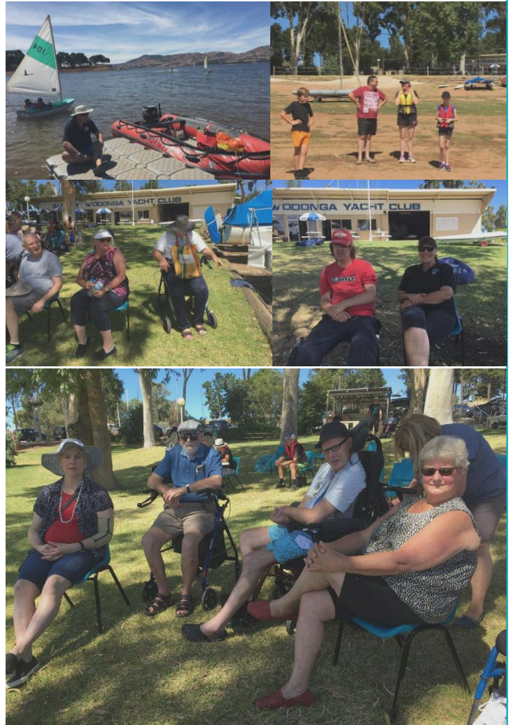
Sailability crew on and off the water.