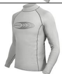
Ronstan GREY Long Sleeve Rash Top CL22 SIZE - S RRP $45