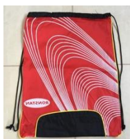
Ronstan String Bag

Anyone wanting to check these items out in colour you can download the newsletter from our website or click on the weblink from our home page.