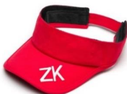
Zhik Visor – Red RRP $20