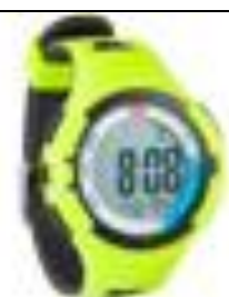
Ronstan Clearstart Waterproof Watch SIZE - Small RRP $98