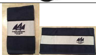
AWYC Embroidered Towel Navy RRP $35