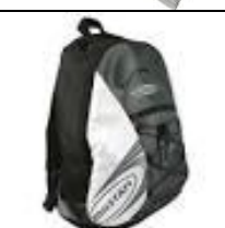
Ronstan Backpack RRP $41