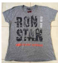
Ronstan LADIES Fitted Grey T'Shirt SIZE - 12