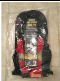
Ultra Automatic Inflatable 150N PFD RRP $130