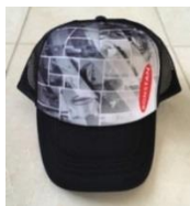
Ronstan Trucker Cap