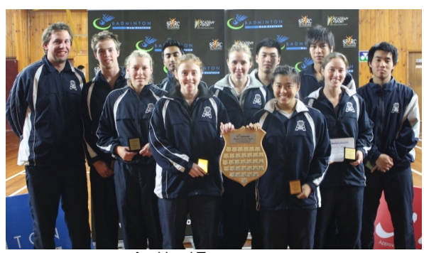
Auckland Team Winners u23 NZ Police Regional Teams Competition

Wellington Badminton successfully hosted the inaugural NZ National u23 Regional Teams Competition and the NZ Police National u23 Championships from 9-13 April this year. There were 6 teams participating in the NZ National u23 Regional Teams Competition being Auckland, Central, Mainland, North, Northern Districts and Waitakere. Auckland signalled their intention to win this competition by sending their strongest team. Half of the players in the Auckland team were currently training in the NZ National Squad and as predicted Auckland went through undefeated to clinch the title.