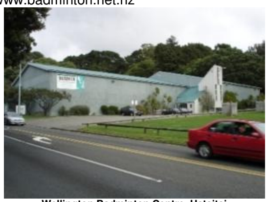
Wellington Badminton Centre, Hataitai

E-Mail: Info@badminton.net.nz Website: www.badminton.net.nz