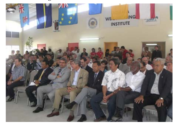
VIP guests waiting for the opening speech.