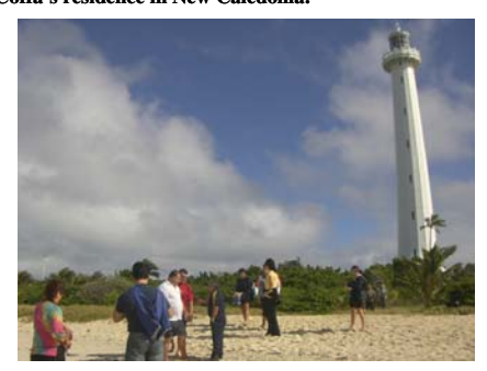
IWF members spending a relaxing day on one of the beautiful islands of New Caledonia.