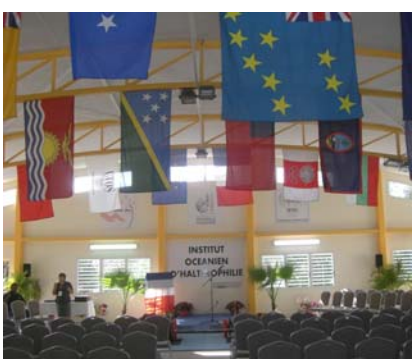
The hall prepared for the Opening Ceremony.

The Institute facilities includes a main training hall with 18 platforms, a second training hall which includes 10 platforms plus general weight training equipment, changing facilities for men and women, weigh-in rooms, doping control room, offices, and reception area. The accommodation area includes twelve rooms with en-suite facilities catering for 24 athletes, a large dining room, television room, kitchen facilities, utilities room, meeting room and offices for the Oceania and Commonwealth headquarters.