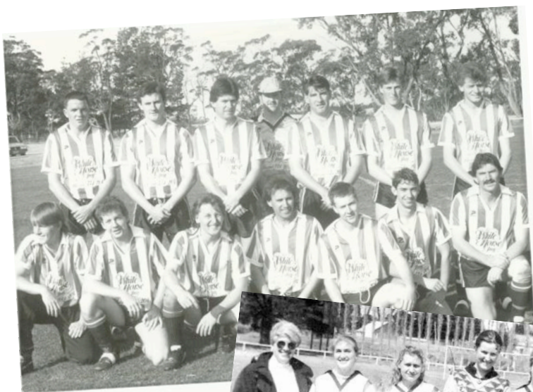
PICTURE 1 1992 1st grade undefeated Premiers & Team Of The Year! <<<<<<<<

MOSS VALE SOCCER CLUB HAS A RICH HISTORY OF SUCCESS IN SENIOR SOCCER! LOYALTY IS PART OF THE REASON FOR THIS SUCCESS. CAN YOU GUESS WHO IS STILL PLAYING WITH MOSSY FROM THE PICTURES BELOW?