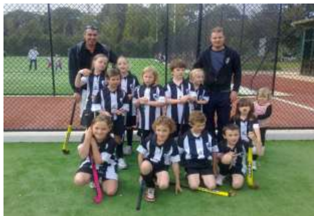
Magpies 2010 Under 9's