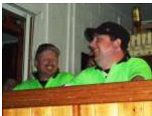
Play by the rules shirts- not only for high visibility behind the bar! Please wear appropriate attire when you umpire- shirts available from the committee room.

A community umpires course was held at the club approx four weeks ago and was attended by around 30 men & women. This course was conducted due to Hockey Metro regulations that are being implemented this year with the understanding they will be enforced next year. The course is designed to give people the basic understanding of rule interpretation and what is required by the umpire when attending games. For those people that attended would you please remember to register online and return your info to me ASAP as I need to start a data base of our qualified umpires. Also any other qualified umpires in the club if you could let me know who you are and supply your umpire Registration number to me it would be greatly appreciated. I know it can be a bit of a nuisance getting into the web site but it should only take around twenty minutes so please try to complete this process soon as we are running out of time and penalties will apply to the club.