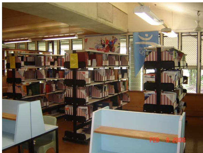
OSIC Serial Collection and reading area

The increase in the interest in sports science and sports related courses has prompted OSIC staff to make sure that the USP library has the latest resources. The introduction of the new degree program in sports science at USP and the diploma and certificate programs at the Fiji Institute of Technology has further enhanced the need for up to date resources in this subject area.