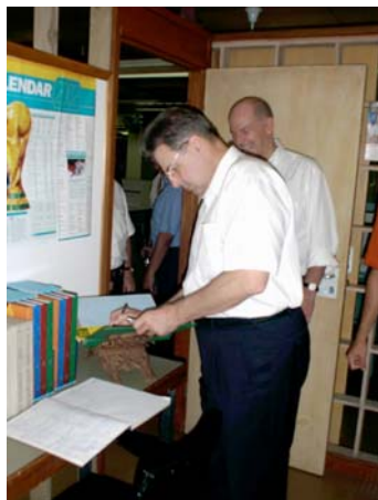
IOC President, Mr. Jacques Rogge & ONOC President Mr. Kevan Gosper signing the OSIC guest book in 2002