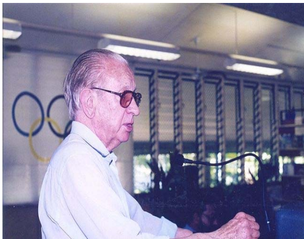
Mr. Juan Antonio Samaranch during the launching of the OSIC website