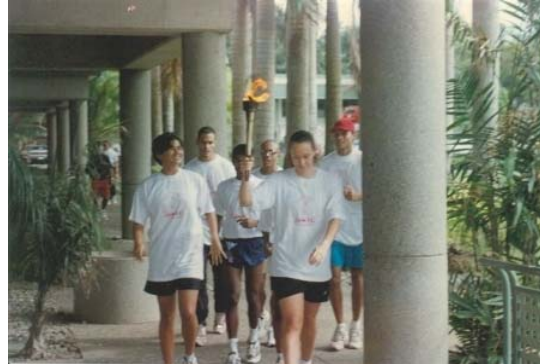
Opening Ceremony Torch Relay