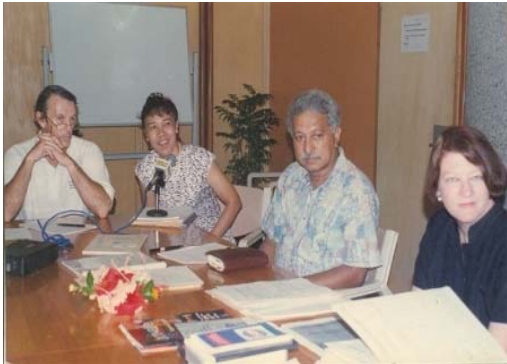
OSIC Advisory Committee