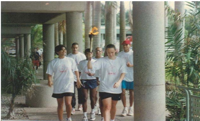
Torch relay during the official opening