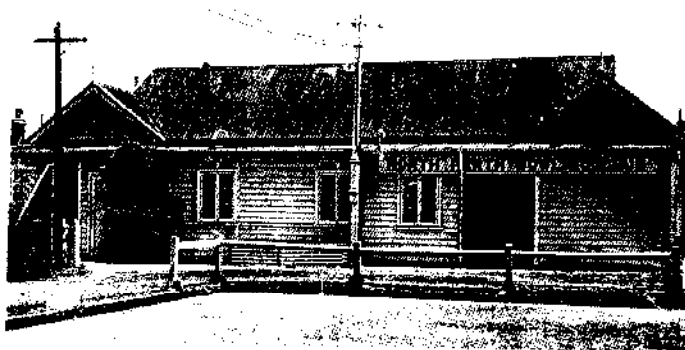
This was North Perth Bowling Club's very first clubhouse. It was built in 1912.

Proudly Sponsored By Swan Breweries Purslowe Funeral Services Bridges Investments Morley Liquor Barn Traditional Framers Princi Butchers BGC Concrete Fletcher Jones